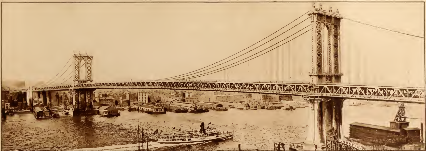
MANHATTAN BRIDGE, connecting New York with Brooklyn, is noted for its approaches. It has helped to relieve traffic congestion and carries Brooklyn's population to work!